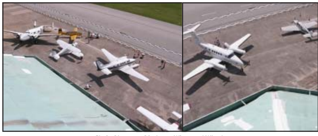
Fly-in Planes on Display at Wings and Wheels

The Houston skyline and the 1940 Air Terminal Museum in the old Houston Municipal Airport building. Also, visible are the Corvairs on display for Wings and Wheels.