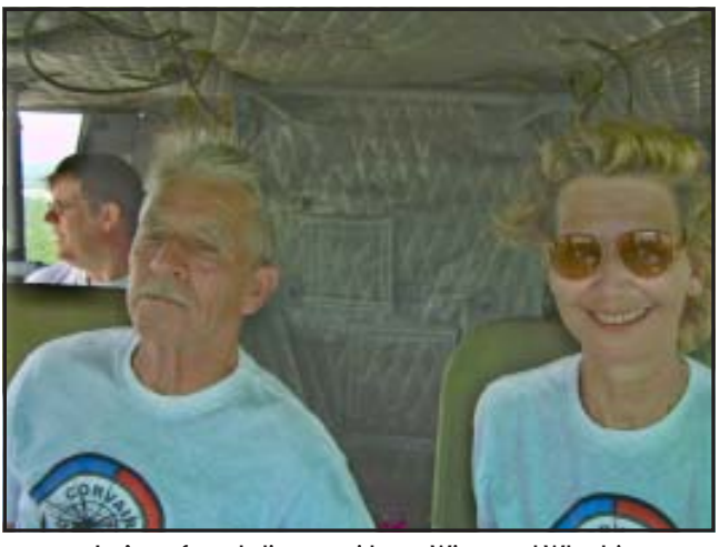
Let's go for a helicopter ride at Wings and Wheels!