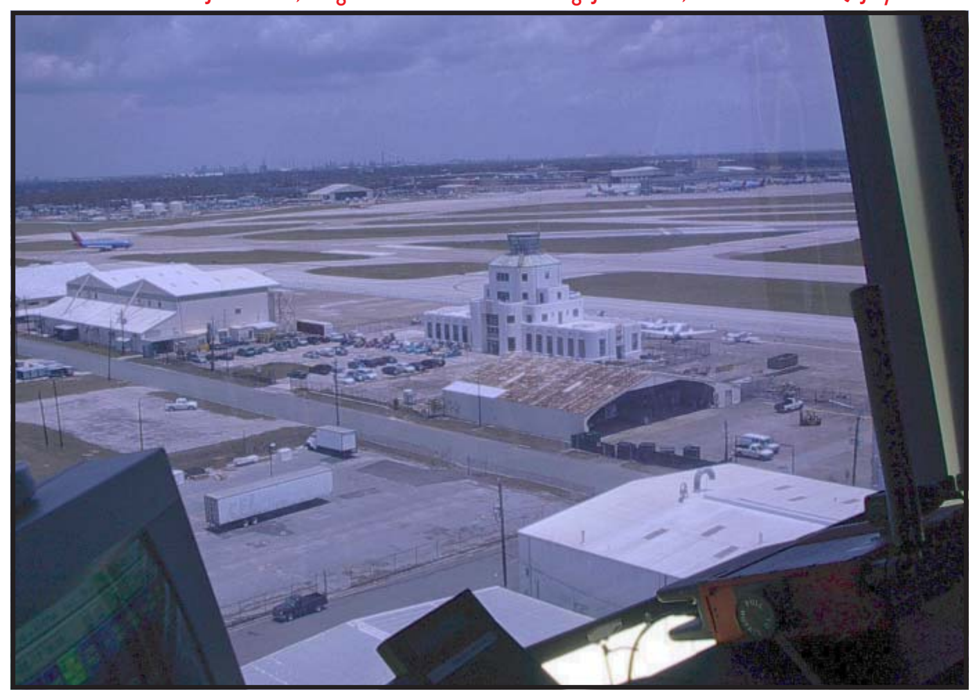
View from the Control Tower at Hobby Airport

This month: Tidwell's Fish Fry and Auction June 13th, Club Meeting June 19th, Richwood 4th Annual Classic Car Show June 20th, Magnolia Main Street Crossing June 29th, Brazoria Bar-B-Q July 4th